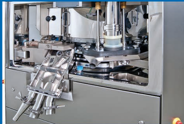
Dust-tight tablet chute on swivel arm