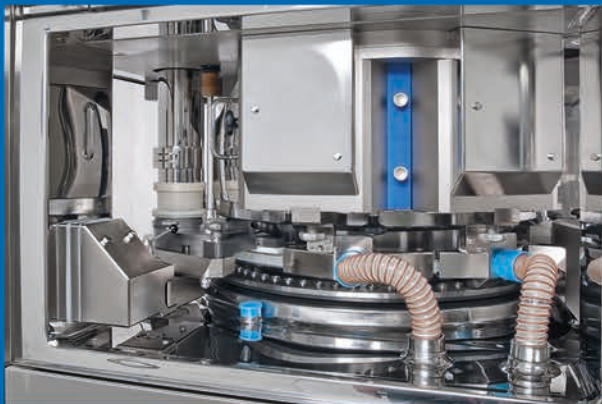
Optimized aspiration system