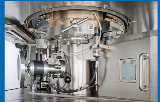
Hermetical separation of compaction and service area