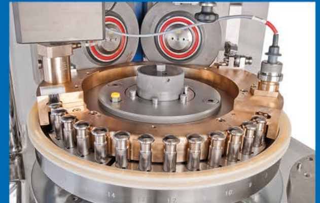
Wide dismantling points