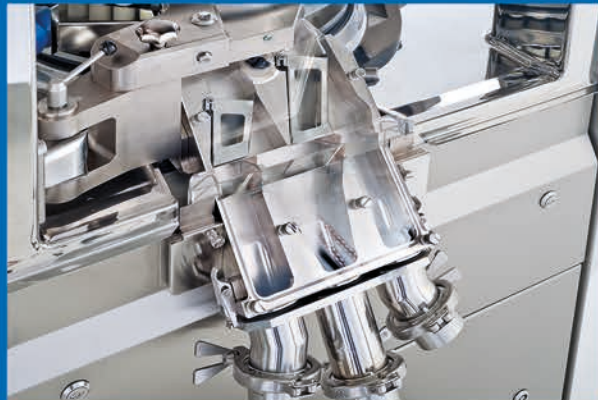
Dust-tight tablet chute on swivel arm