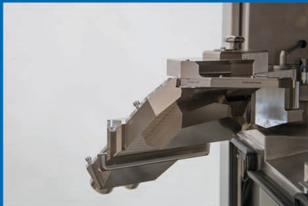
Tablet chute mounted on swivel arm