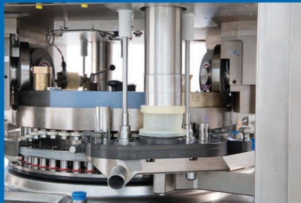
Highly efficient filling system