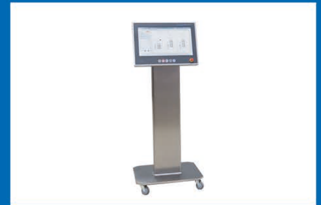
External user friendly HMI