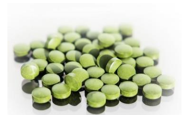
Perfect (100% natural) tablets