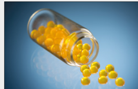
Primary packaging for pharmaceutical solids