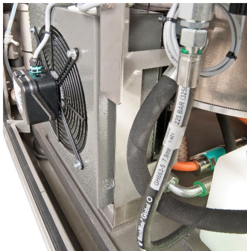
Cooling device Siemens torque drive